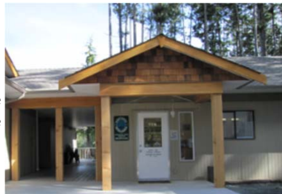
Coastal Fire Centre, Parksville, BC

The Coastal Fire Centre is an area with 85% of BC's population and has a large body of water bisecting it. This means that bases with access to transportation hubs, that are strategically spaced, and not hampered or delayed by waterways, is essential.