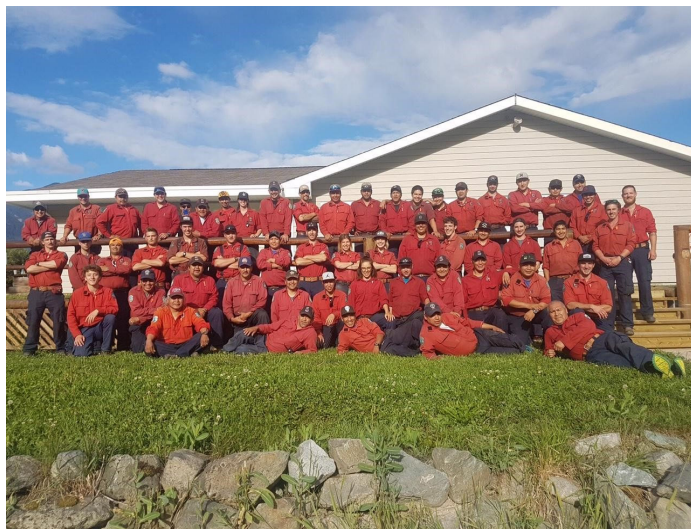
The Heatseeker, Salish & Ravens Unit Crews